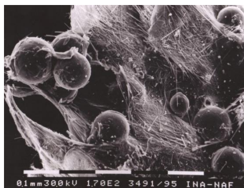
Figure 1. SEM photograph of mordenite and opal-CT from vein in altered pyroclastic rock from Lepoglava [2]

So far zeolites have been found at several locations in Croatia, but mostly they are present in low concentrations. They were found in vugs and veins in altered volcanic rocks (ferrierite at Gotalovec [1], heulandite, mordenite, dachiardite at Lepoglava (Figure 1.) [2], laumontite at Hruškovec [3]), in altered pyroclastic rocks (analcime at Muć [4], clinoptilolite at Maovice [5] and Medvednica Mt. [6]), and cement in sandstone (laumontite and stilbite at Velešnja [7]).